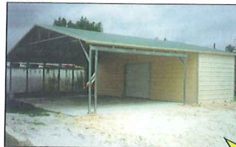
Built Better - Built Stronger