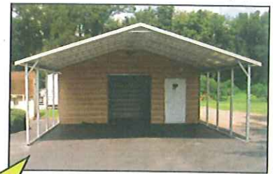
Horizontal Roof Boxed Eave