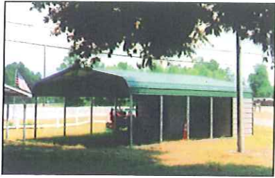
Custom Configurations Available

AL, AR, GA, IN, KY, LA, MO, MS, NC, OK, SC, TN, TX, VA